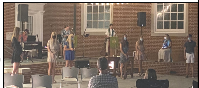
Celebration of our 2019-2020 Confirmation class during Evening Worship.