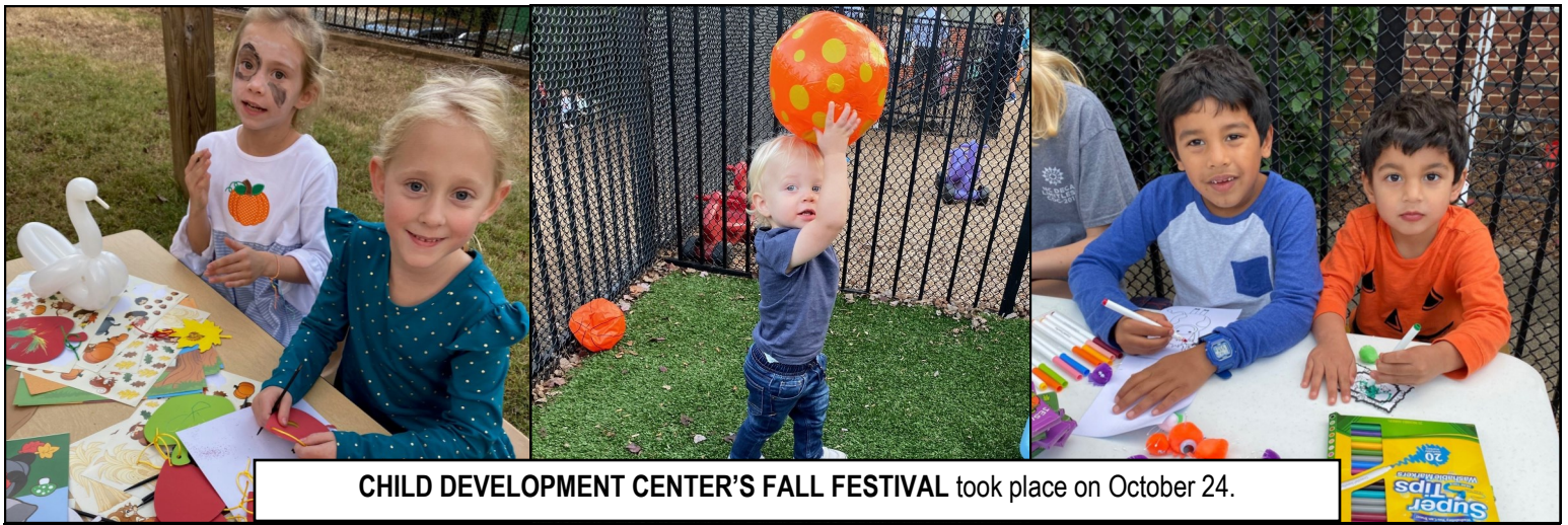
CHILD DEVELOPMENT CENTER'S FALL FESTIVAL took place on October 24.