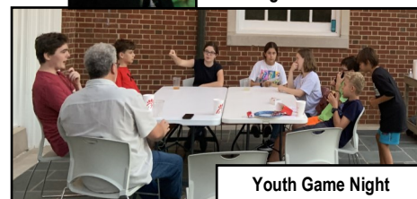
Youth Game Night