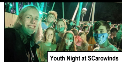
Youth Night at SCarowinds

Special note: Until further instruction from the SAPC task force, youth events will be held outside when possible, and masks must be worn when we gather inside.