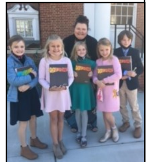
THIRD GRADERS RECEIVED BIBLES SUNDAY, NOVEMBER 14