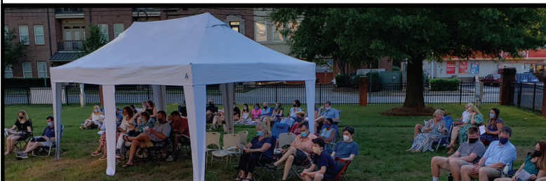
Senior High Recognition Worship Service was held the evening of July 26.